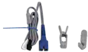
Nellcor Veterinary SpO 2 Sensor