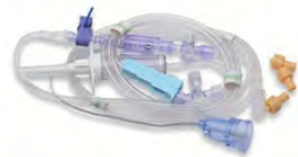
Veterinary IBP Connector