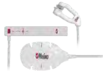
Masimo Veterinary SpO 2 Sensor