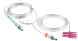
Veterinary EtCO 2 Sampling Lines