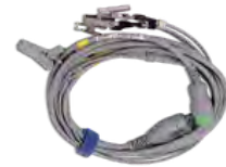
Veterinary 3-lead ECG Cable (Monitor)