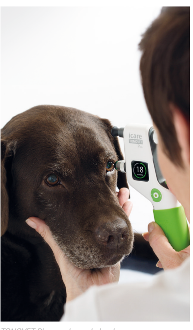
TONOVET Plus used on a Labrador