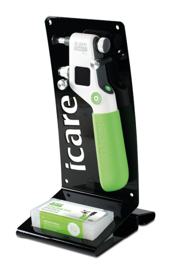
STAND FOR TONOVET PLUS