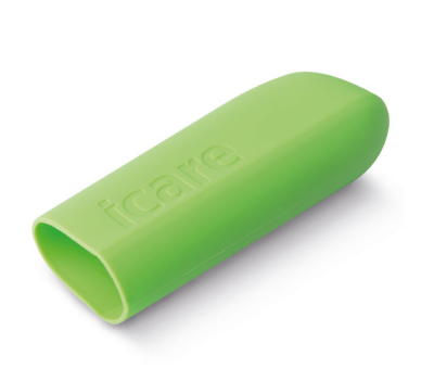
SILICONE GRIP FOR TONOVET PLUS