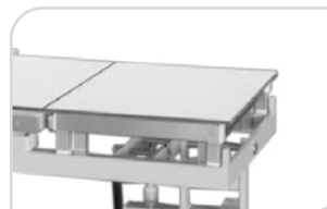
Insert for OP-System 602.635-OPSN