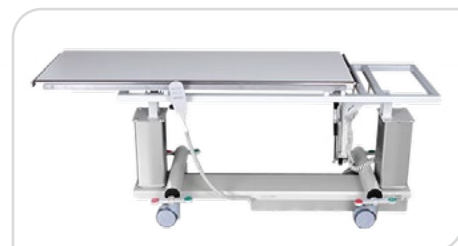
Version with sliding top